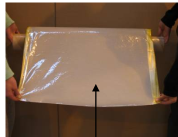
FibaRoll. This roll has been removed from its open ended bag. Note that you can see the top surface; the other side goes down onto the substrate