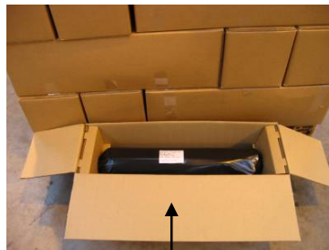
FibaRoll in box's. Note the cardboard supports keeping the roll from being damaged. 25 rolls per pallet.