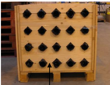
FibaRoll in wooden stillages.20 Rolls per stillage. Stillages can be triple stacked.

FibaRoll is supplied on rolls wrapped in a black UV blocking bag to exclude any light. The roll core is supported at each end to prevent flat spots developing during storage. The storage bags are double ended allowing removal from either end.